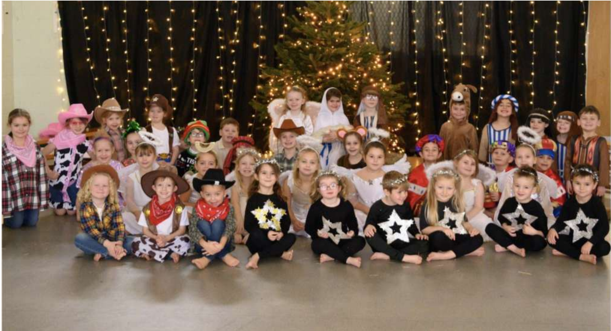
Prickly Hay- Nativity Play 2025