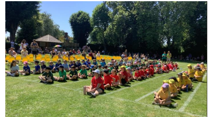
Sports Day 2024