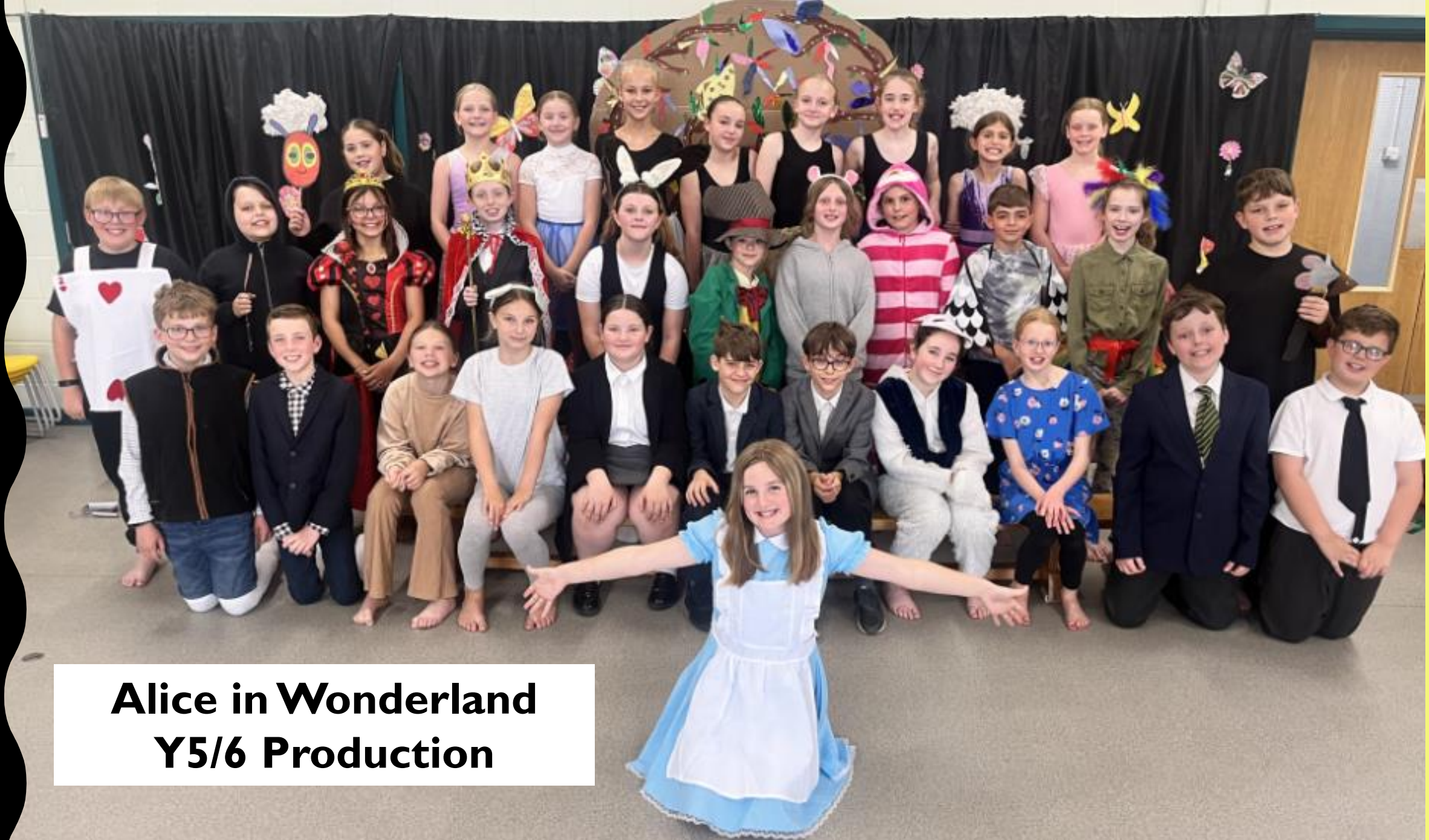
Alice in Wonderland Y5/6 Production