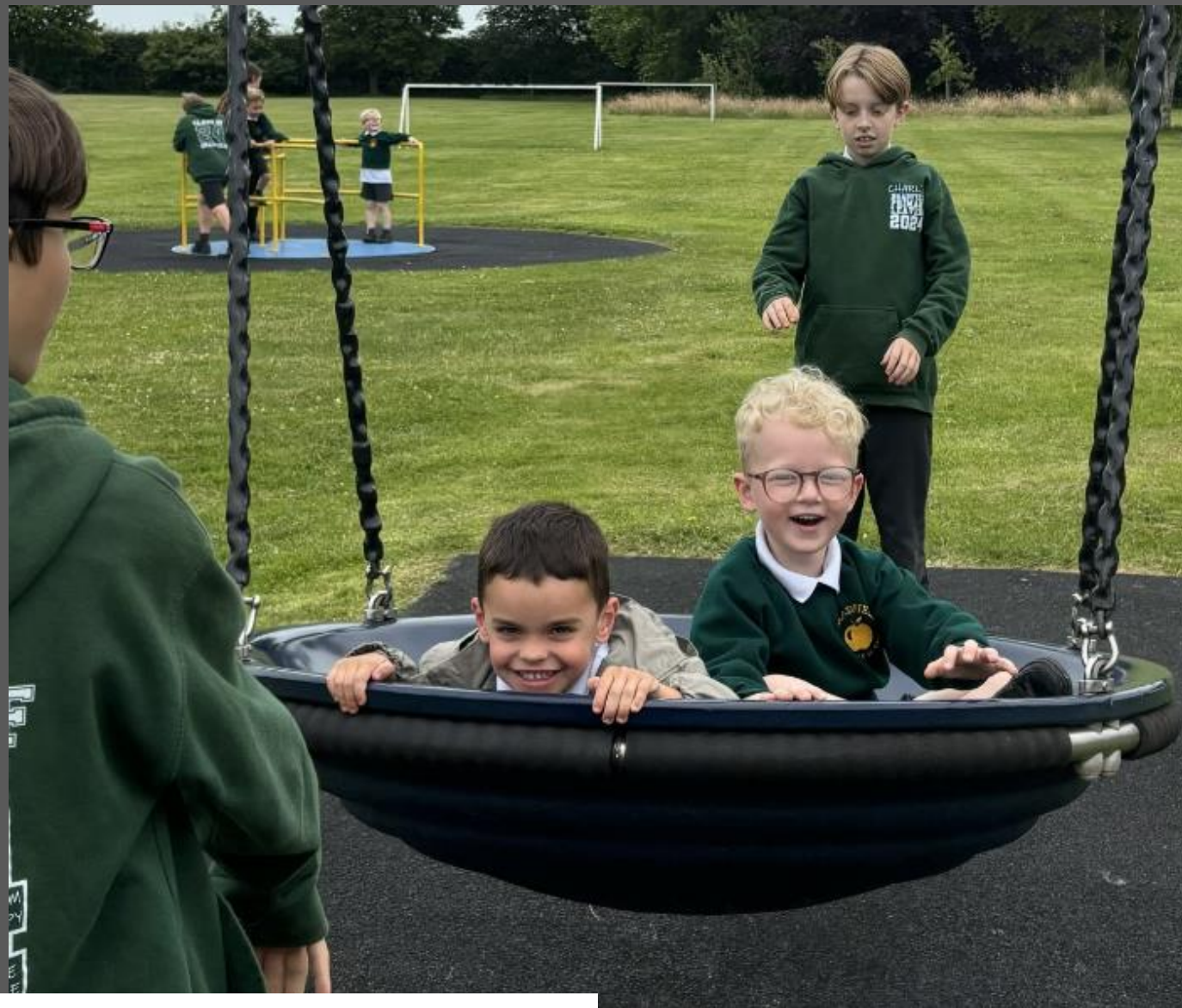
Buddy Time at the Park