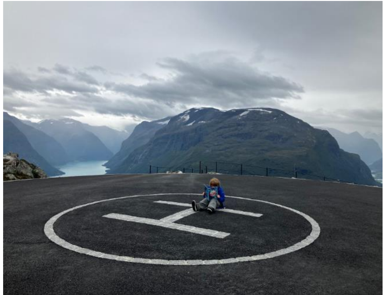
On top of the world, reading about Norway, in Norway, on a helipad. Sienna