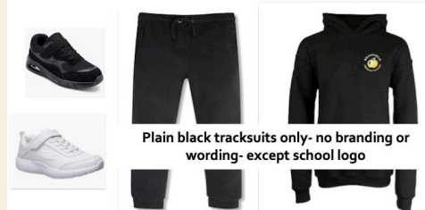
Plain black tracksuits only- no branding or wording- except school logo