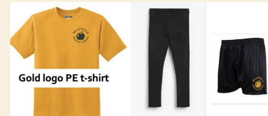
Gold logo PE t-shirt