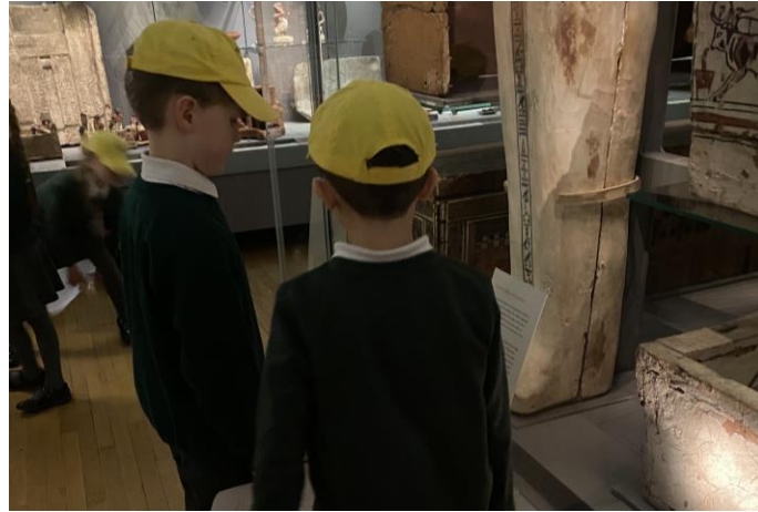
Discovery visit to the Fitzwilliam Museum to see the Egyptian exhibits.