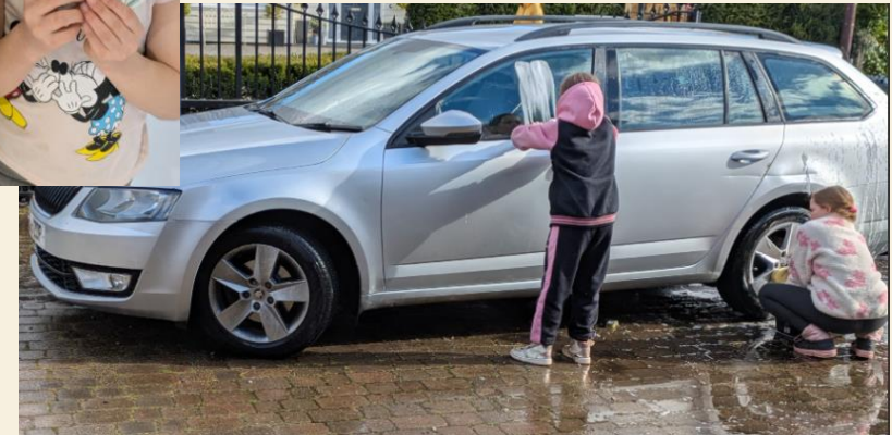
Charlotte and Leelah

We are so proud of both girls, combined Charlotte and Leelah managed to earn a massive amount of £110 for FOBS by washing cars for £5 all weekend!