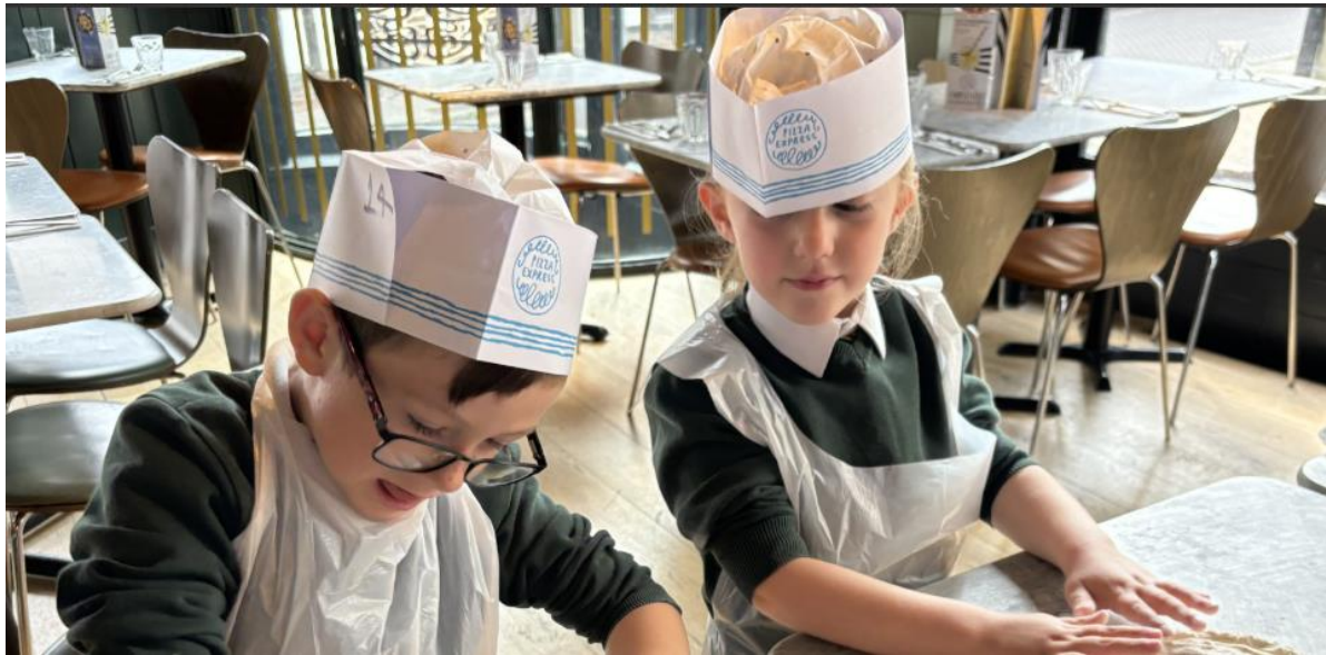
Bramley Class Trip to Pizza Express