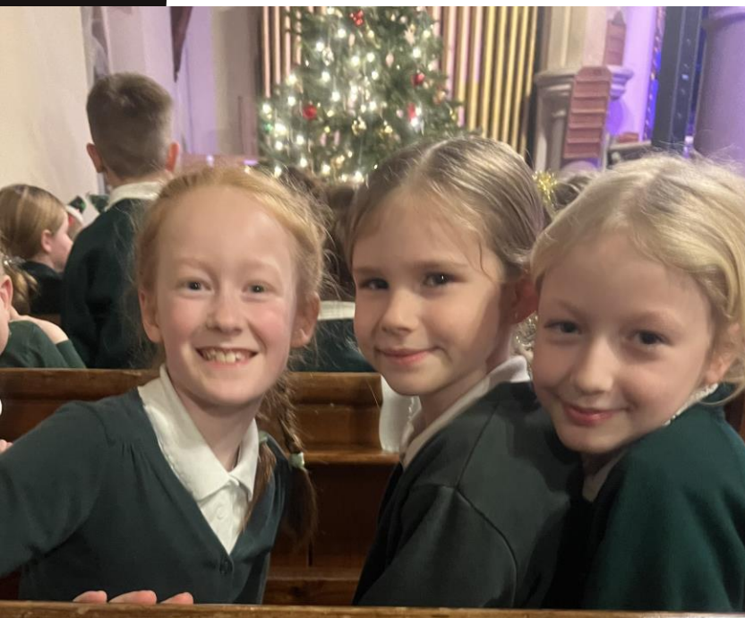
Our school choir sang beautifully at the Magic of Christmas concert held at St Mary and St Michael's church in Mistley on Wednesday.