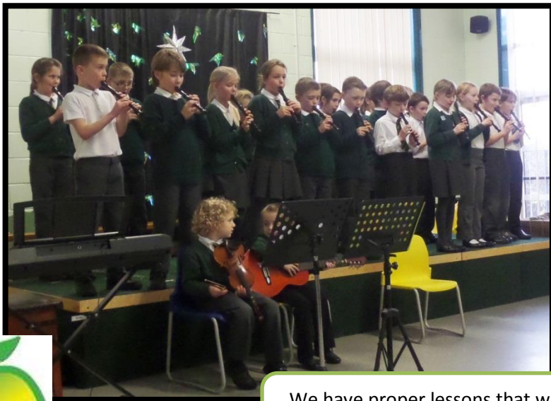
We have proper lessons that will help us learn in the future.