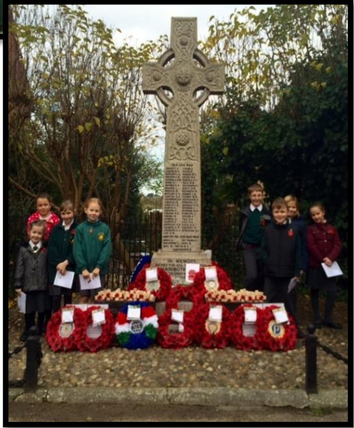
The best thing about this school is the learning and the open space to play.