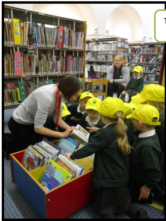
This school helps me improve my work because I use my learning behaviours.