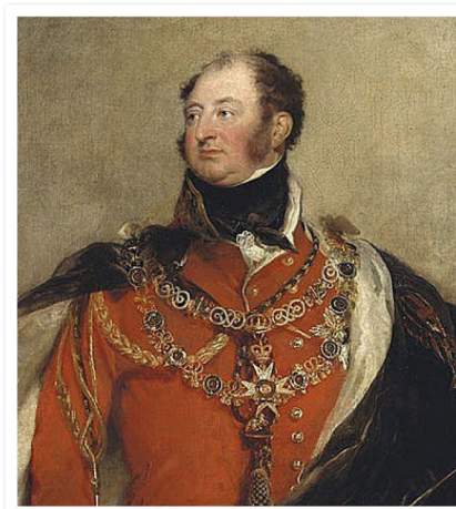
Portrait of Prince Frederick

The Grand Old Duke of York is thought to be about Prince Frederick, Duke of York and Albany, who was the second son of King George III. In 1794, Frederick was asked to lead a huge army against the French. Frederick was not a good leader, and he lost the battle. Frederick decided to learn how to be a better leader. He worked hard, and his army went on to win many battles.