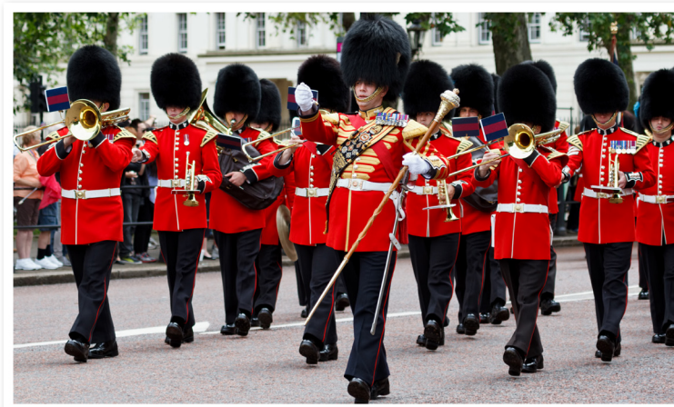
military marching band

A marching band is a group of musicians who perform their music while they are marching. They usually play brass, woodwind and percussion instruments. The musicians often wear a uniform and perform in parades or at special events. They usually march in lines and are led by a conductor. They work together to keep in time and follow the beat of the music.