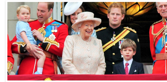
HM Queen Elizabeth II

Queen Elizabeth II is the current monarch of the United Kingdom. She was born in 1926 and became queen in 1952. The Queen is famous across the world.