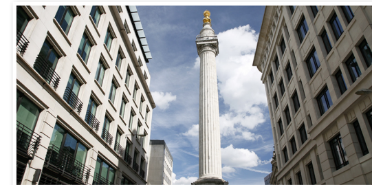
Monument to the Great Fire of London

The Great Fire of London was a significant event in London's history. It began in a bakery on Pudding Lane on Sunday 2nd September 1666. Many buildings were destroyed, including St Paul's Cathedral. Today, a monument stands near the place where the fire began.