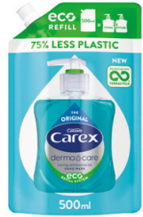
Carex® hand wash refill pouches and caps